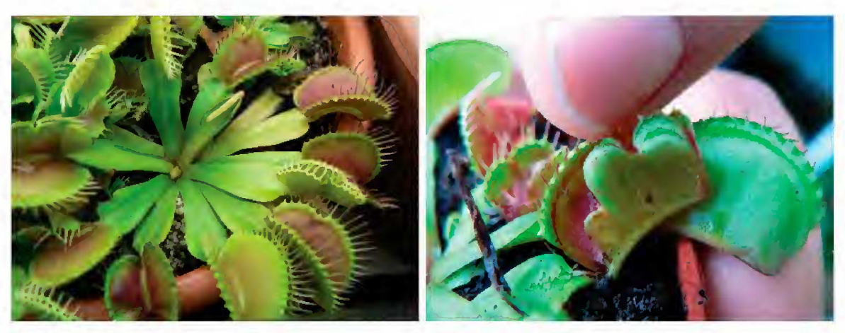
Figure 2: Dionaea 'Bec de Lièvre' plant and deformed trap.

—Bonnet Sébastien • 20 hameau des noëls • 10000 Troyes • France • bonnet.troyes@free.fr